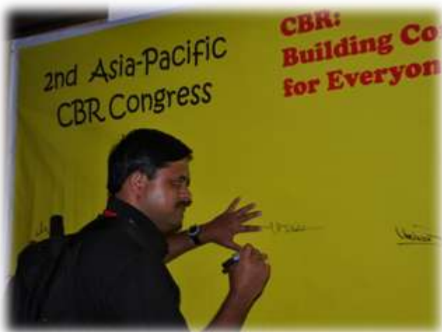
Signature by person who cant see, for his rights

First global congress of CBR announced in India and the theme will be "Community Based Rehabilitation - The Key To Realizing Convention on Rights of Persons with Disabilities". During the 2nd Asia Pacific congress, Signature campaign launched to sensitize and promote the awareness of UNCRPD 2006 during the conference. All the AIFO Participant shown their commitment by adding their signature on the campaign poster.